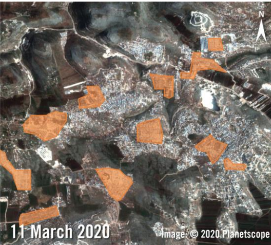
Satellite imagery from 18 January 2019 (on the left) shows 11 established camps – highlighted in orange – less than 5km east of the border with Turkey in Idlib, Syria. Satellite imagery from 11 March 2020 (on the right) demonstrates that the number of structures in the area around the 11 camps had expanded greatly during the 14 intervening months.