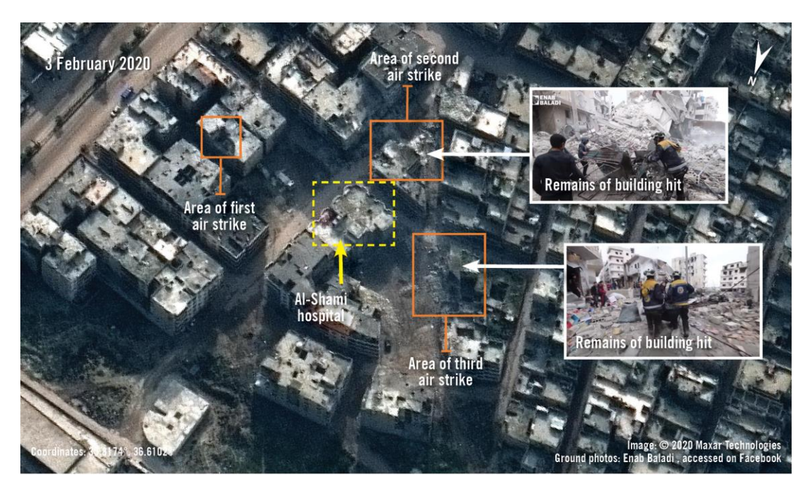
Satellite imagery taken on 3 February 2020 showing al-Shami hospital and its environs after the three air strikes that took place on 29 January 2020. Damage to adjacent buildings is visible in the orange squares.

The inset photographs, taken on 30 January 2020, show civil defence volunteers inspecting the remains of the building hit in the second and third air strike.