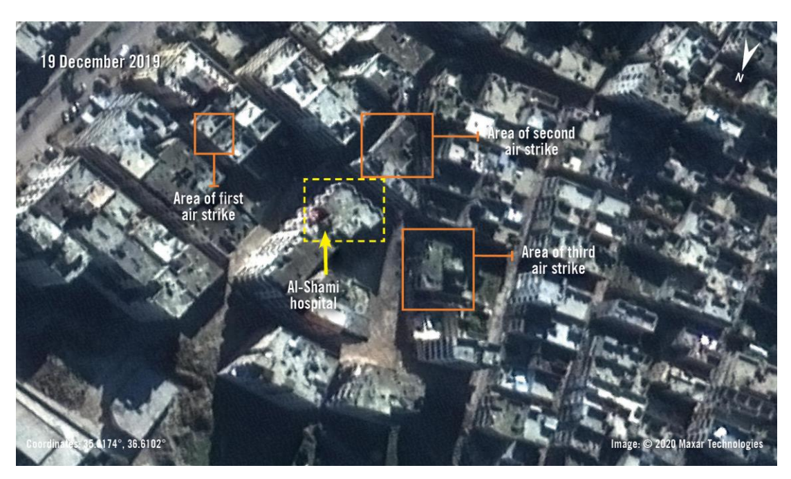
Satellite imagery taken on 19 December 2019 showing al-Shami hospital and its environs before the three air strikes that took place on 29 January 2020.

Al-Shami hospital closed after the attack due to the damage to equipment in it and the advance of government forces into Ariha.